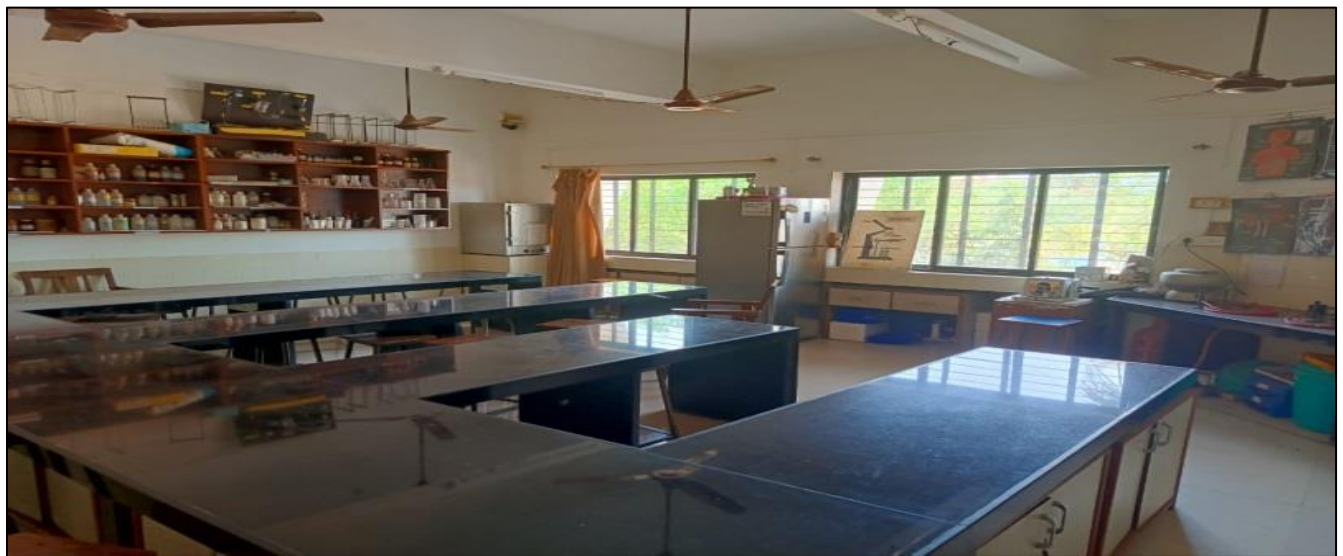
ADMLT/MLT Lab : 22X 22 sq.ft.