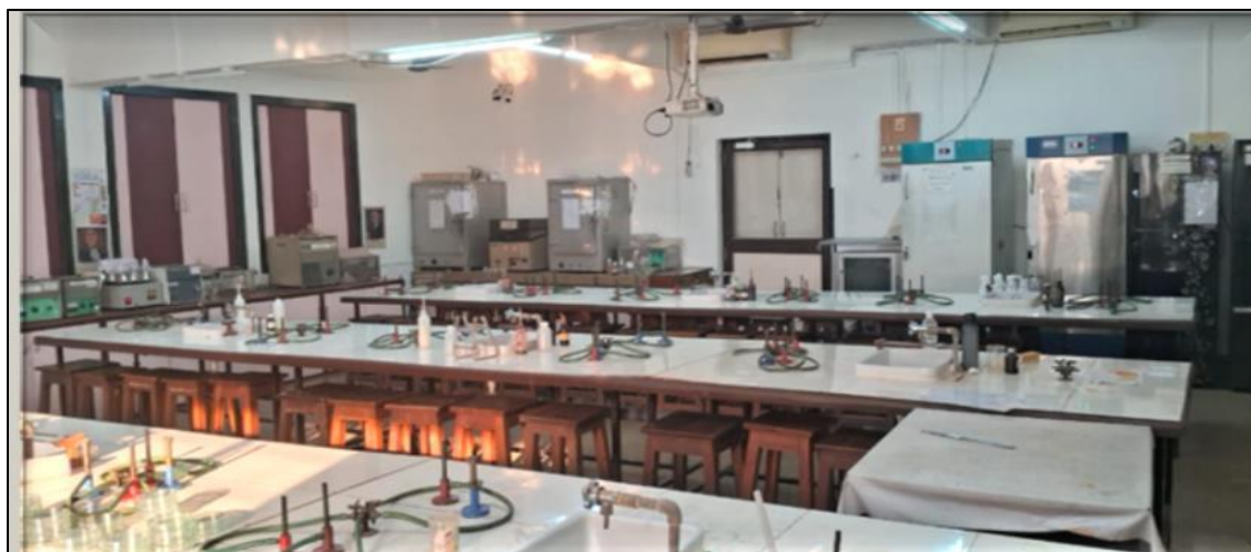
UG Lab: 40 x 30 sq. ft.